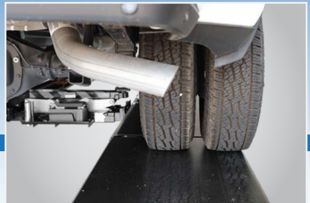
26" ULTRA-WIDE RUNWAYS