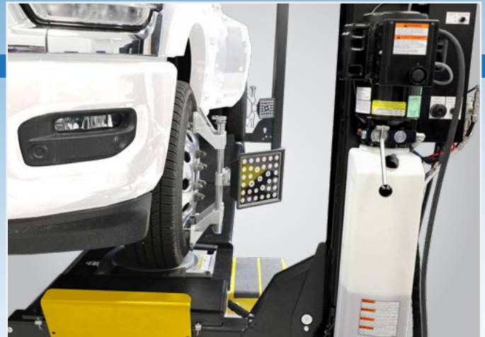
*Shown with AC200 clamps